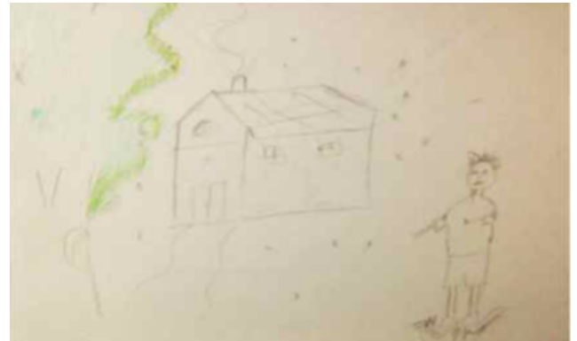
Figure 7 House-Tree-Person.

The client came voluntarily for counseling with her irrational belief that she has Truman's syndrome. With the help of cognitive interventions the counselor was able to challenge her irrational beliefs. The client was very stressed out when she came for counseling so before starting the therapy she was taught deep breathing relaxation technique so that she could cope with her stress in a better way.