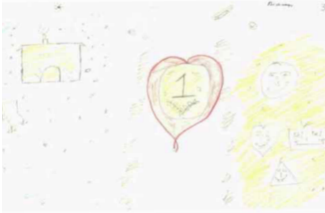
Figure 3 Three Wishes.

to an animal. She mentioned that it was a great experience to first think and then draws an animal to which she thinks she resembles ( Figure 4 ).