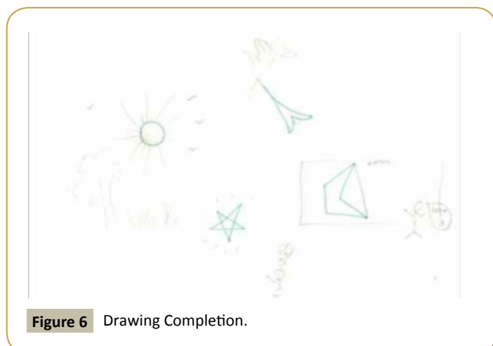
Figure 6 Drawing Completion.