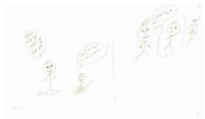
Figure 5 Self-Portrait.