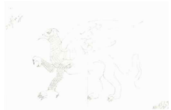
Figure 4 Draw Yourself as an Animal.